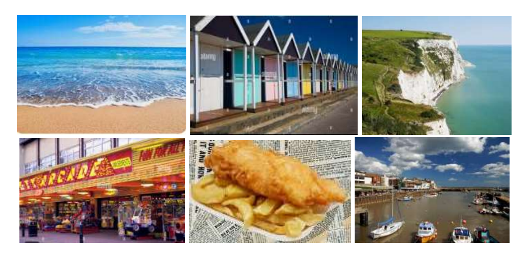
Do you know their names?

If you go to the seaside can you see any of these things?